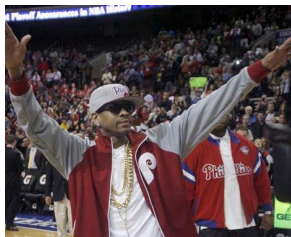
Allen Iverson, NBA icon, struggles with life after basketball