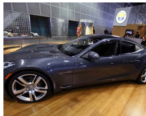
Five myths about electric cars